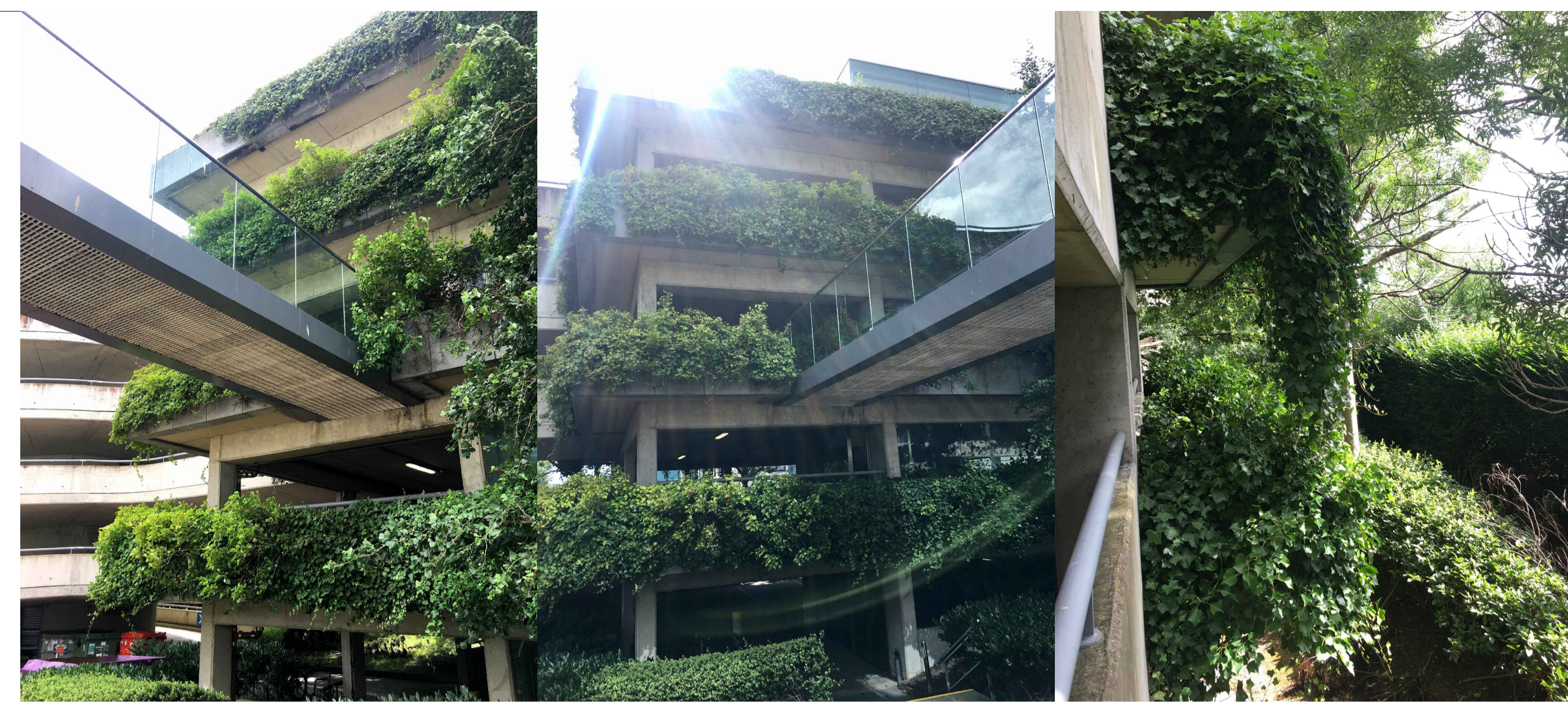
Hedera hibernica - Ivy green wall to Frascati East Point

Lonicera japonica 'Haliana' (Evergreen Honeysuckle) 4m height